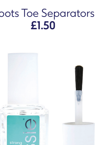
Essie Nail Care Strong Start Nail Polish Base Coat £8.99