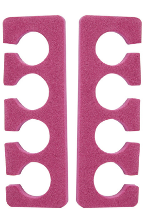
Boots Toe Separators £1.50