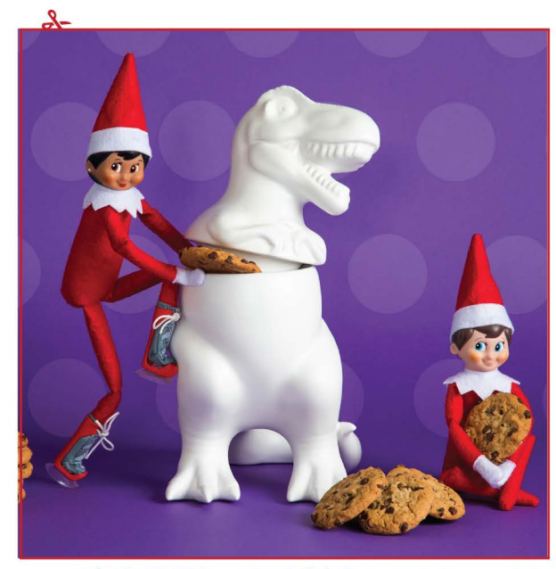
\protect\operatorname{\fill} @/TM/ \protect\operatorname{\fill} 2021 CCA and B, LLC d/b/a The Lumistella Company. All Rights Reserved.