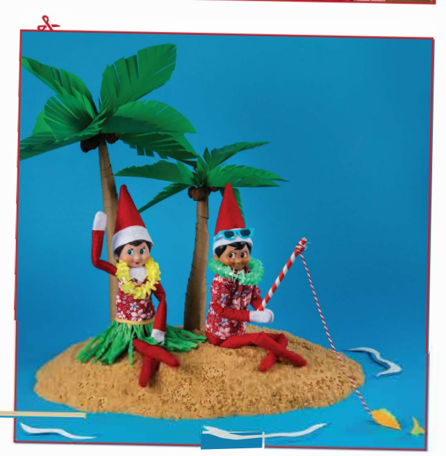
®/TM/© 2021 CCA and B<sub>j</sub> LLC d/b/a The Lumistella Company. All Rights Reserved.