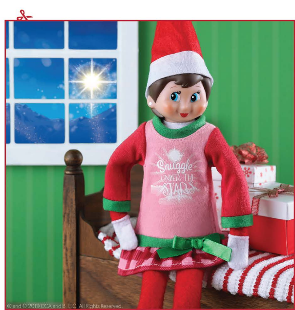
®/TM/© 2021 CCA and B, LLC d/b/a The Lumistella Company. All Rights Reserved.