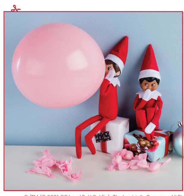
®/TM/© 2021 CCA and B, LLC d/b/a The Lumistella Company. All Rights Reserved.